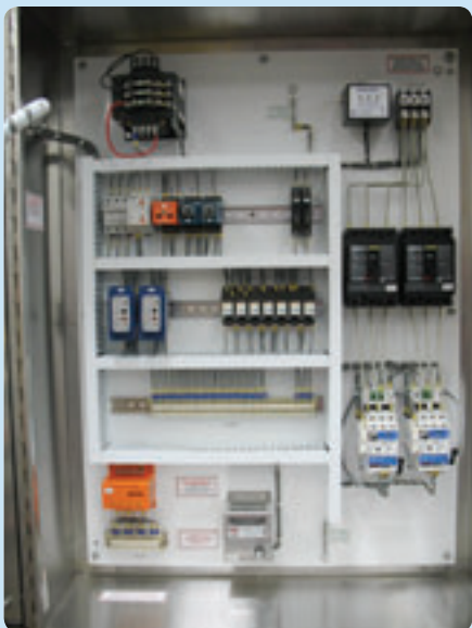
Hurricane Gustav storms left the plant's controls enclosure three-quarters underwater.